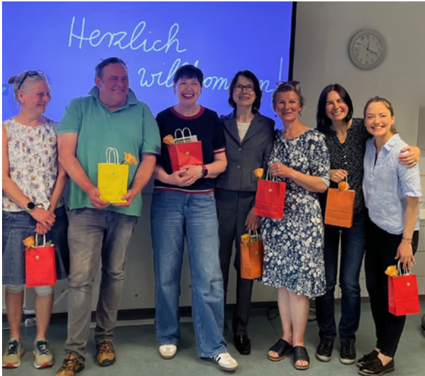
VHS-Lehrkräfte der Integrationskurse in Göttingen